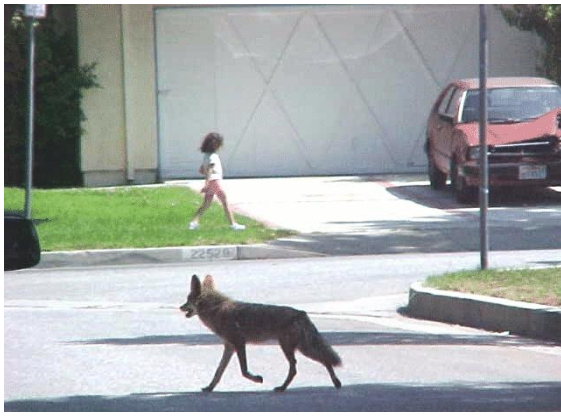
Figure 2. An urban coyote strolls through West Hills, a suburb of Los Angeles, California, in July 2002.